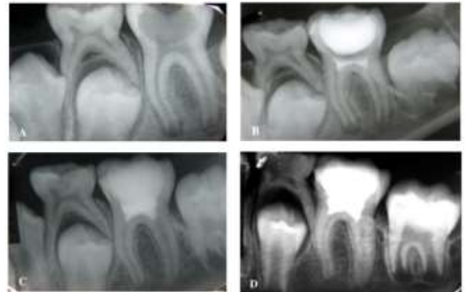
Figure 1. Radiography of case No. 250 undergoing MTA pulpotomy, A: Primary radiography; B: Radiography after epoxogenesis; C: Radiography after 6 months; D: Radiography after 12 months