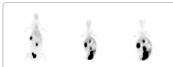
Fig. 2. Representative SPECT imaging of different treatment groups.