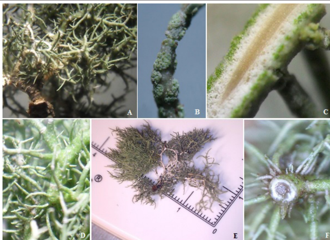
Figure 3. Usnea glabrescens (Vainio) Vainio sens. Lat. A: Attachment point and base of thallus; B: Apical branch with soralia; C: Branch with medulla; D: Soralia and papillae on main branch; E: Thallus; F: Transverse section.