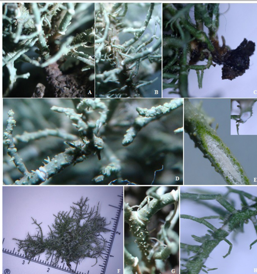
Figure 3. Usnea cornuta Körber. A: Base without cracks, B: Fibrils, C: Base of thallus, D: Lateral branches with soralia, E: Branch with medulla, F: Thallus, G: Papillae; H: Lateral branch with fibrils.

small (less than half the branch diameter), but sometimes coalescing into larger patches ( figure 3D ) near the apices of branches and fibrils as described by Van Haluwyn et al. , 2013 (10).