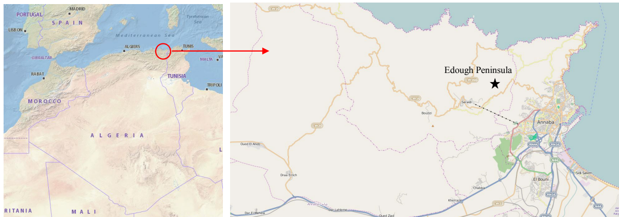
Figure 1. Localization of the study and collecting site in Edough Peninsula (North East of Algeria). ★ : Study area.